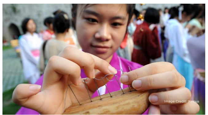
Traditional needle-threading competition held today