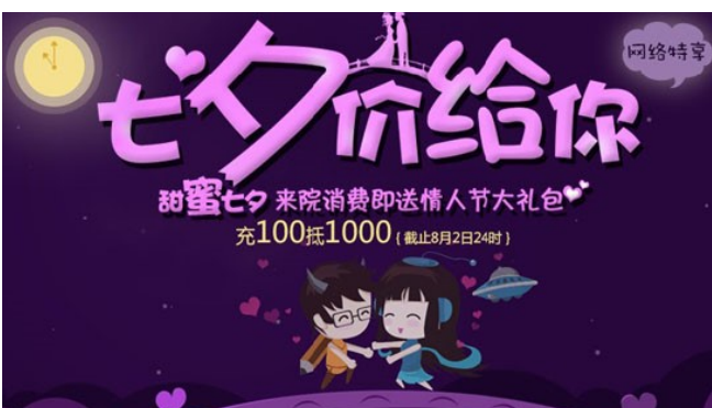
Advert offering discounts on Qixi gifts