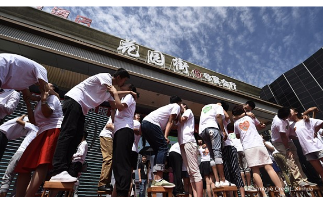
Kissing contest held in Shanxi province