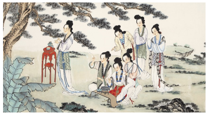
Traditional painting depicting women celebrating Qixi

Traditionally, women would hold 'asking for skills' competitions like needle-threading and the most skilful was believed to receive the best marital fortune from the heavens.